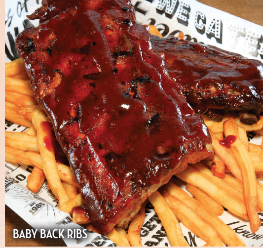
BABY BACK RIBS

BLACKENED SALMON* .....20.99 WILD CAUGHT BLACKENED SALMON | SAUTÉED IN A CREAMY LEMON SAUCE | SERVED OVER STEAMED RICE | TOPPED W/ AVOCADO SALSA | GRILLED ASPARAGUS