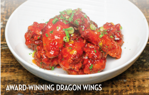
AWARD-WINNING DRAGON WINGS

TRADITIONAL OR BONELESS (MARKET PRICE) 6 WINGS • 12 WINGS